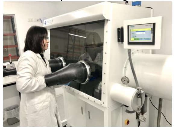
Altech staff in product development