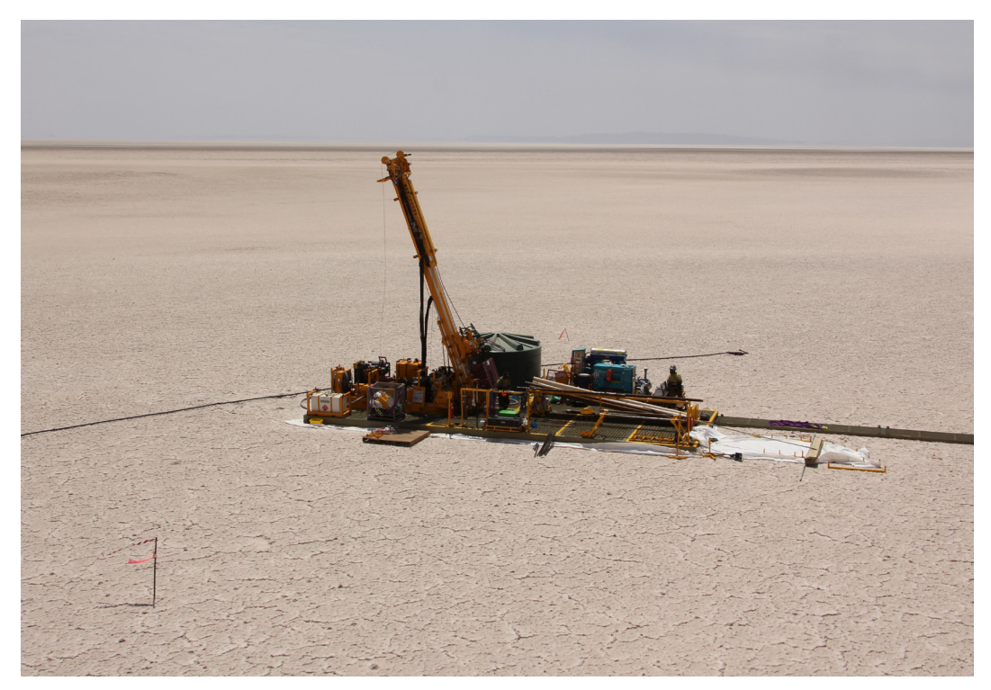
Photo 1 Heli-portable drilling commences at the Torrens exploration site.

Argonaut Resources NL ABN 97 008 084 848